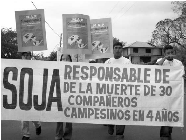
Protest against RTRS conference in Paraguay. August 2006